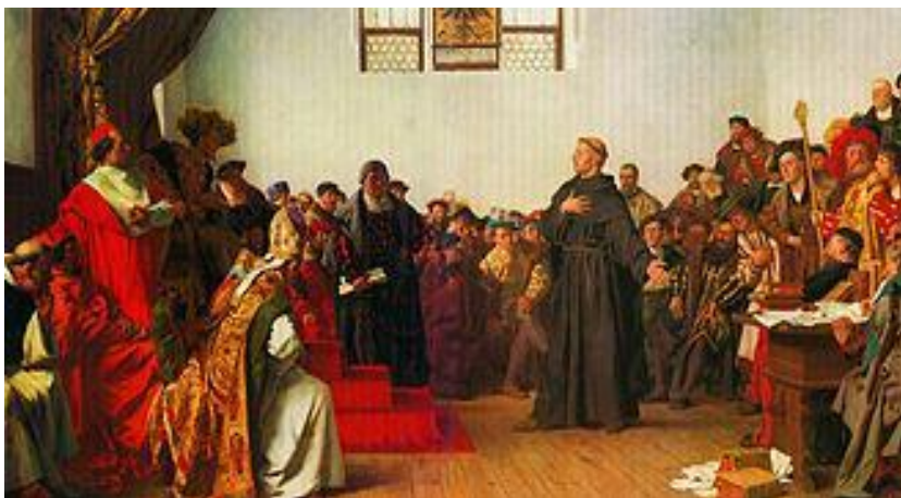
A famous Luther defending a remarkable outlook of world and experiencing stress. The painting is from Anton von Werner in the year 1877.

D. Stress of functioning pertaining to view of life