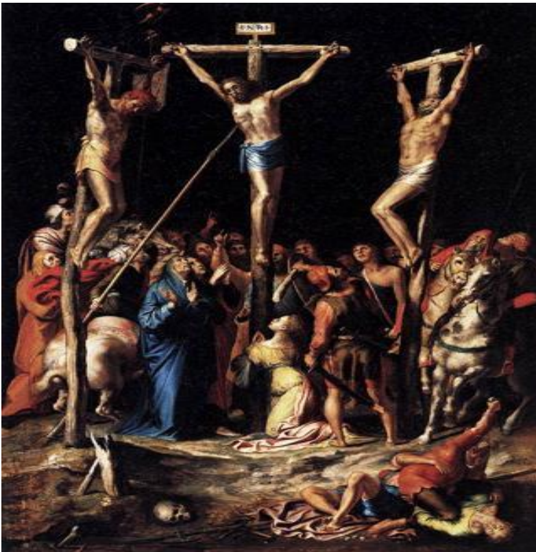
A famous physical punishment: Pieter de Kempeneers description of crucifixion circa 1550.