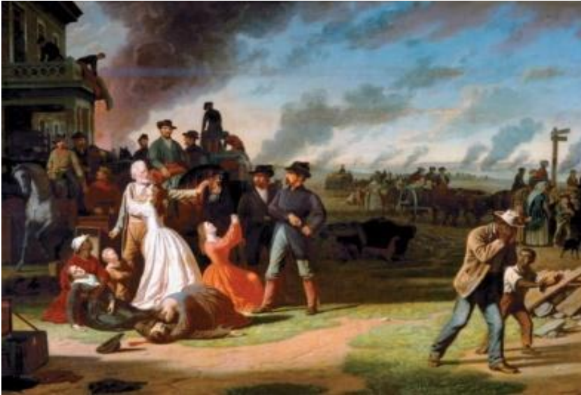
A practical form of punishment: eviction from home. George Caleb Bingham's painting in 1861.

D. Punishment / disappointment experiencing in functioning pertaining to outlook on life: in religion, dealing with values and ideologies, in ethical development etc.