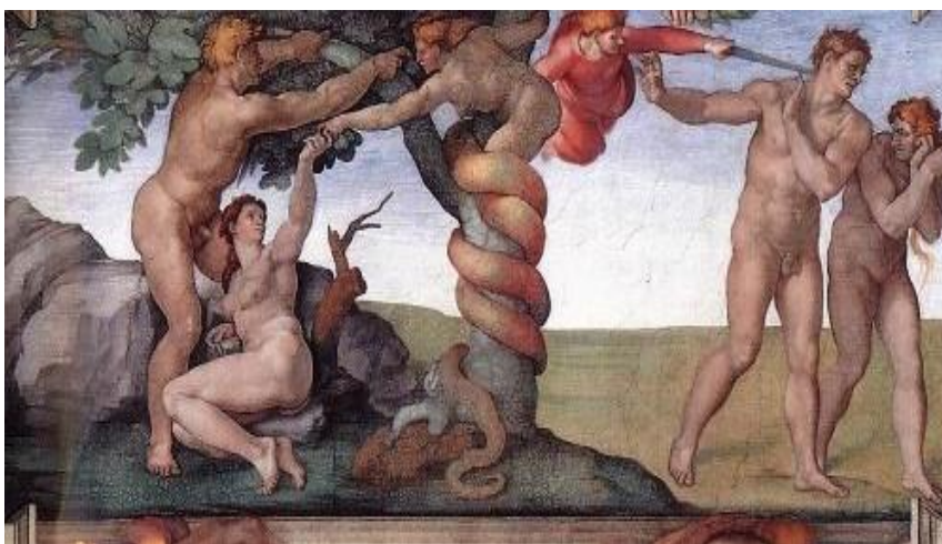
Michelangelo's "The Fall" in circa 1510 describes the accusation of conscience.