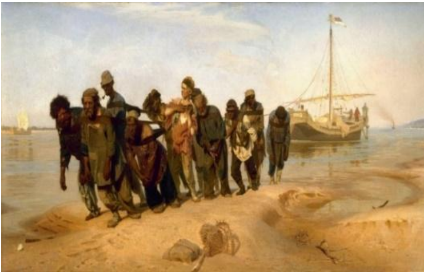
Ilya Repin's description of working stress of ferrymen in Volga "Barge Haulers on the Volga". The year was 1873.

D. Stress of functioning pertaining to view of life