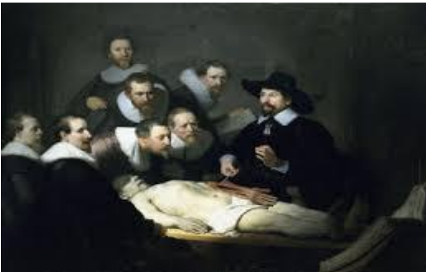
Rembrandt in "The Anatomy Lesson of Doctor Tulp" from the year 1632 describes the organic loss, which is widely exploited by humans.

B. Losses / physical exercise and bodily functions . Losses related to ability to move about on your own, keep- fit exercises, motor coordination, relaxation exercises etc.