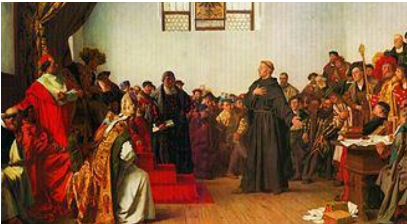
A famous Luther defending a remarkable outlook of world and experiencing stress. The painting is from Anton von Werner in the year 1877.

D. Stress of functioning pertaining to view of life