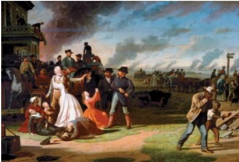
A practical form of punishment: eviction from home. George Caleb Bingham's painting in 1861.

D. Punishment / disappointment experiencing in functioning pertaining to outlook on life: in religion, dealing with values and ideologies, in ethical development etc.