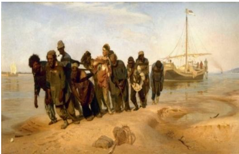
Ilya Repin's description of working stress of ferrymen in Volga "Barge Haulers on the Volga". The year was 1873.

D. Stress of functioning pertaining to view of life