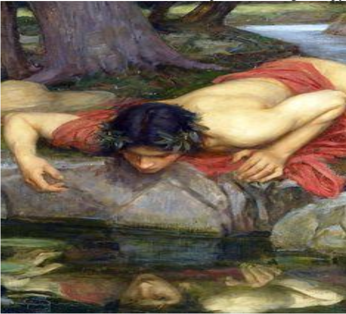
John William Waterhouse described here one famous alone human being in ancient Greek mythology Narcissus. The year was 1903.

Loneliness in mobility / physical exercise / bodily functions.