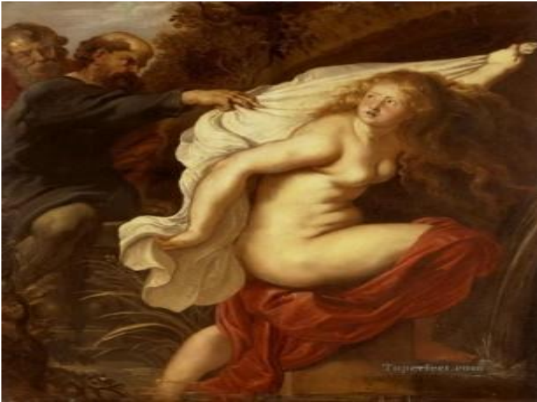
Rubens description of being disgraced. The year was 1611.