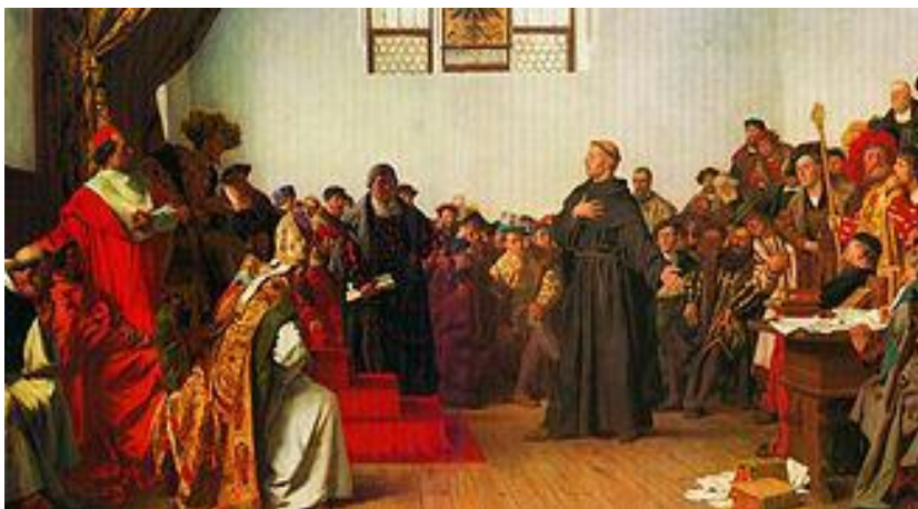
A famous Luther defending a remarkable outlook of world and experiencing stress. The painting is from Anton von Werner in the year 1877.

D. Stress of functioning pertaining to view of life