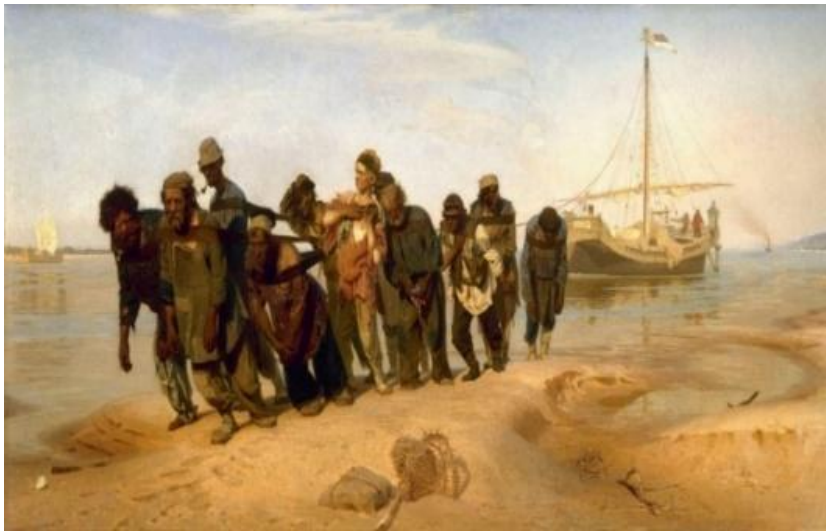
Ilya Repin's description of working stress of ferrymen in Volga "Barge Haulers on the Volga". The year was 1873.

D. Stress of functioning pertaining to view of life