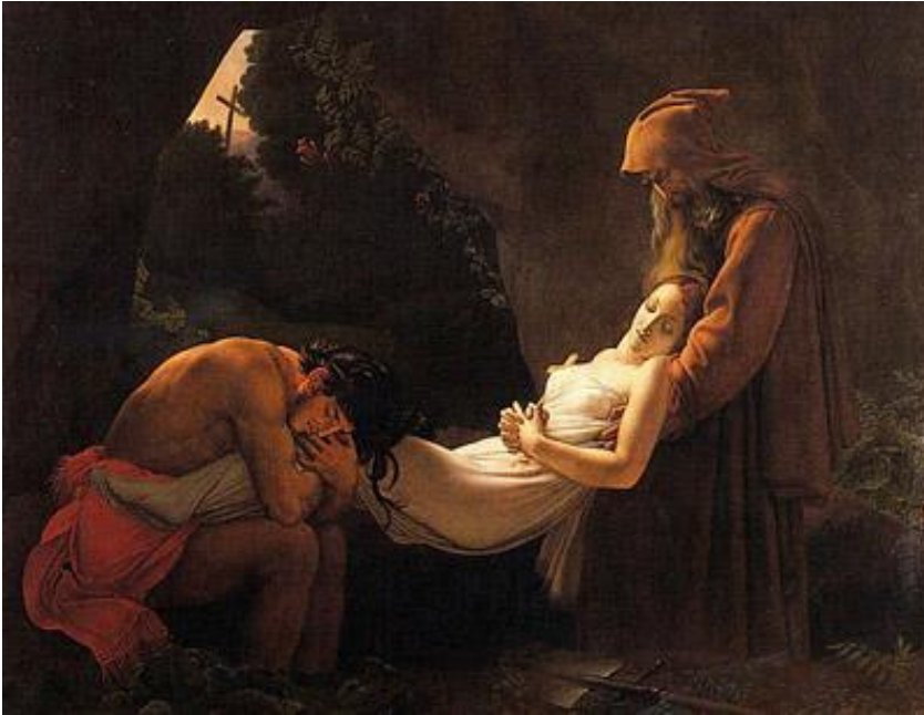
"The Burial of Atala", the loss of human relations. The painting was made in 1808 by Anne Louis Girodet.

A. Losses in human relationships : in social development, in chances to function with other people, self expression etc.