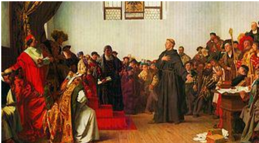
A famous Luther defending a remarkable outlook of world and experiencing stress. The painting is from Anton von Werner in the year 1877.

D. Stress of functioning pertaining to view of life